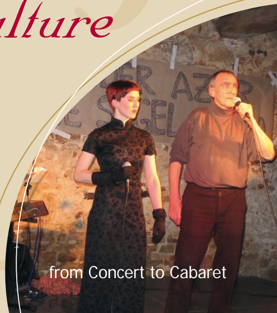
from Concert to Cabaret