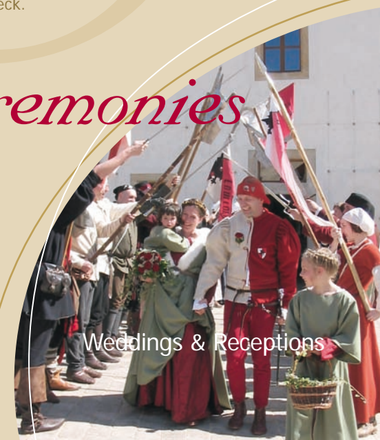
Weddings & Receptions