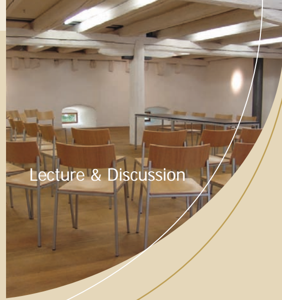
Lecture & Discussion